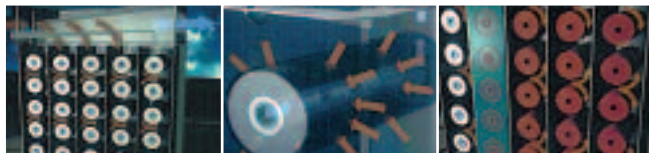
Overall System Air Flow

PHOENIX ® radial flow canisters, using our CENTAUR ® HP carbon combined with our patented segmented reactor design, produce a system that can continuously remove up to 50 ppm of H 2 S with 99% average efficiency.